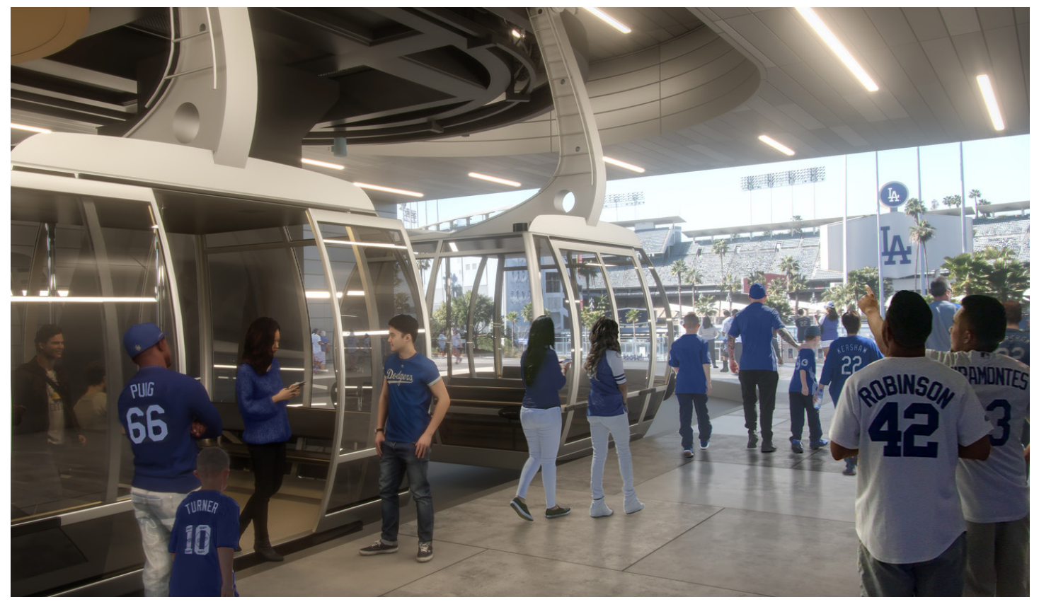
A rendering shows passengers getting off gondola cars at Dodger Stadium.

On game days, hundreds of cars heading to Chavez Ravine jam surrounding streets, causing traffic tieups and parking headaches for Echo Park residents.